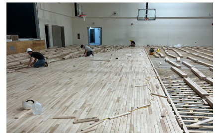
Above: Gym flooring placement.