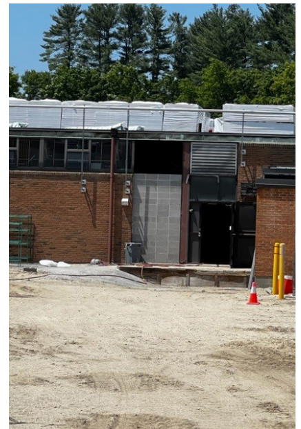
Above: Masonry infill work and roofing at existing school is ongoing.